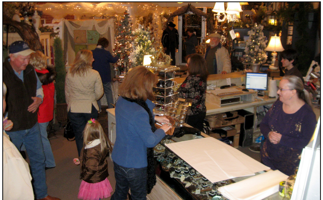
Shoppers inside Renaissance during last year's Downtown Christmas Open House.

How do I find out more? Old Town Cape has information on the website about this process at www.oldtowncape.org or call 573-334-8085.