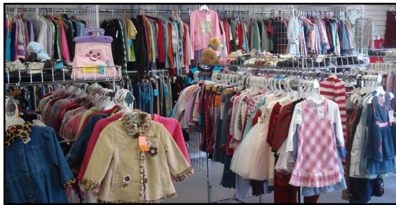
LEFT: A peek at all of the clothes inside Lil Pea Patch at 709 Broadway. RIGHT: An outside view of The Tarnished Buckle, a new consignment store in downtown Cape.