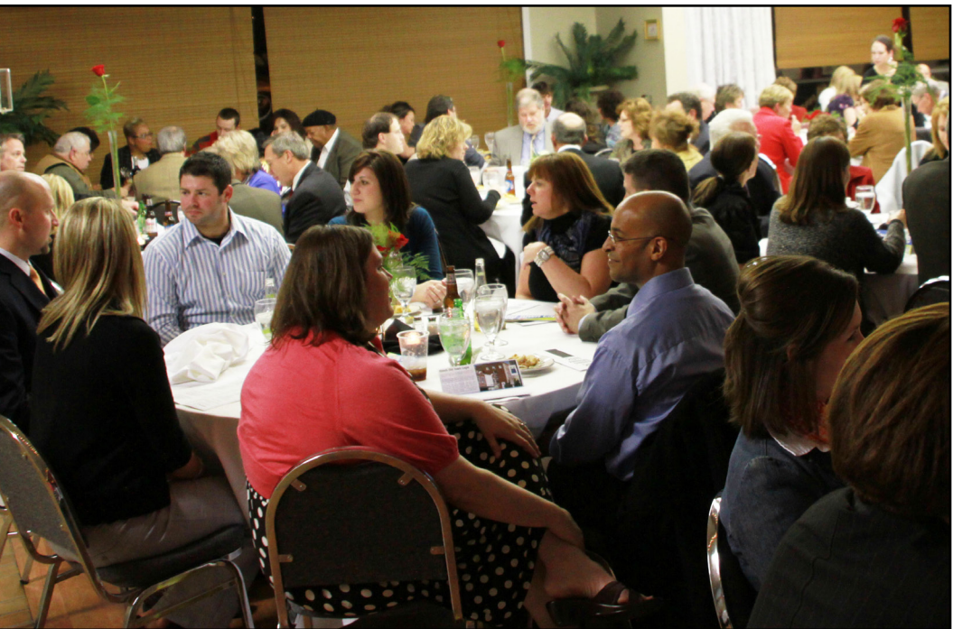
A look at last year's Annual Dinner.

Old Town Cape's Annual Dinner, sponsored by Red Letter Communications, is Thursday, February 23rd at Dockside The Upper Deck, 4 North Spanish. Please join us as we celebrate downtown accomplishments in 2011 and honor deserving businesses and individuals for special projects. Social hour starts at 6, and the dinner and program begin at 7. The social hour will be held in the Bilderbach Arts Plaza adjacent to Dockside. There you can mingle among art and friends at Westray Studio, MoZaic, The Painted Wren, Gallery of Inspiration and Goddard Photography. A cash bar will be