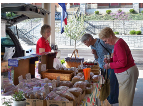
A look at the Farmer's Market in downtown Washington, MO.