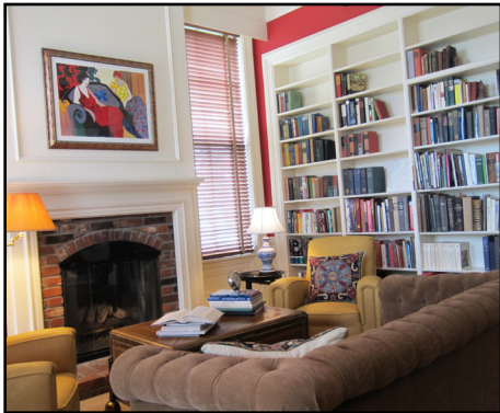
TOP: A look at the inside of one of the homes from last year's tour.

Visit www.oldtowncape.org/events for more information closer to the date of the event.