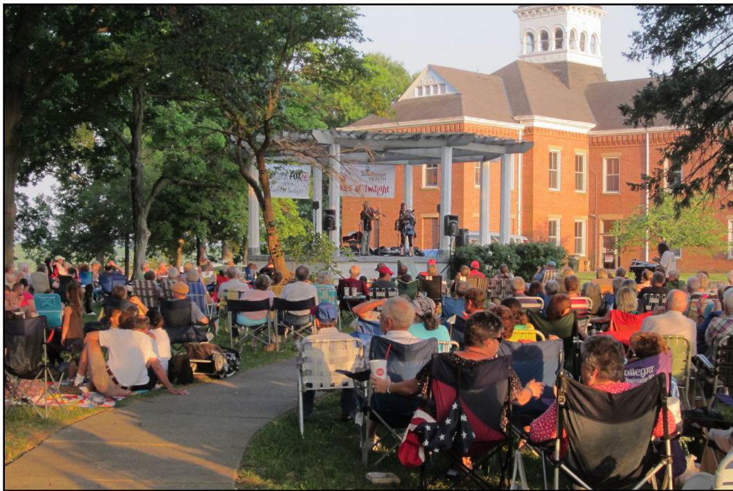
TOP: A view of one of last year's Tunes at Twilight concerts