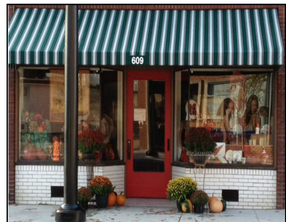
TOP LEFT: An outside look at Broadway Market & Loft. TOP RIGHT: A look at the creative space inside of SNL Marketing.

The property at 300 Broadway will serve as the reception area where participants can get additional information and resources and see the vision of downtown. Present at the reception area will be the Executive Director of Old Town Cape, representatives from the Chamber of Commerce and the City of Cape Girardeau.