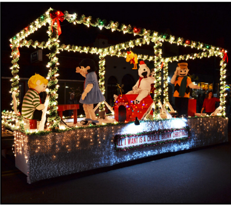
TOP: A look at one of last year’s floats by Pure Country C106.1.

The 22nd Annual Parade of Lights will be held on Sunday, December 1 and will begin at dusk. This year’s theme is “Christmas Fun for Everyone.” The parade will start at Capaha Park and proceed down Broadway, turning right on Main and ending at Merriwether. Entries in the parade are limited to the first 100 applicants and each entry must be lighted and play or sing Christmas music. For information on how to enter the parade, visit www.oldtowncape.org/events . We also encourage you to participate in the parade even if you don’t have an entry. You can engage with the thousands of people that will line the parade route by having extended hours and a special or giving away hot chocolate or apple cider. The Parade of Lights is sponsored by Rhodes 101 Stores, Drury Southwest and Robinson Construction.