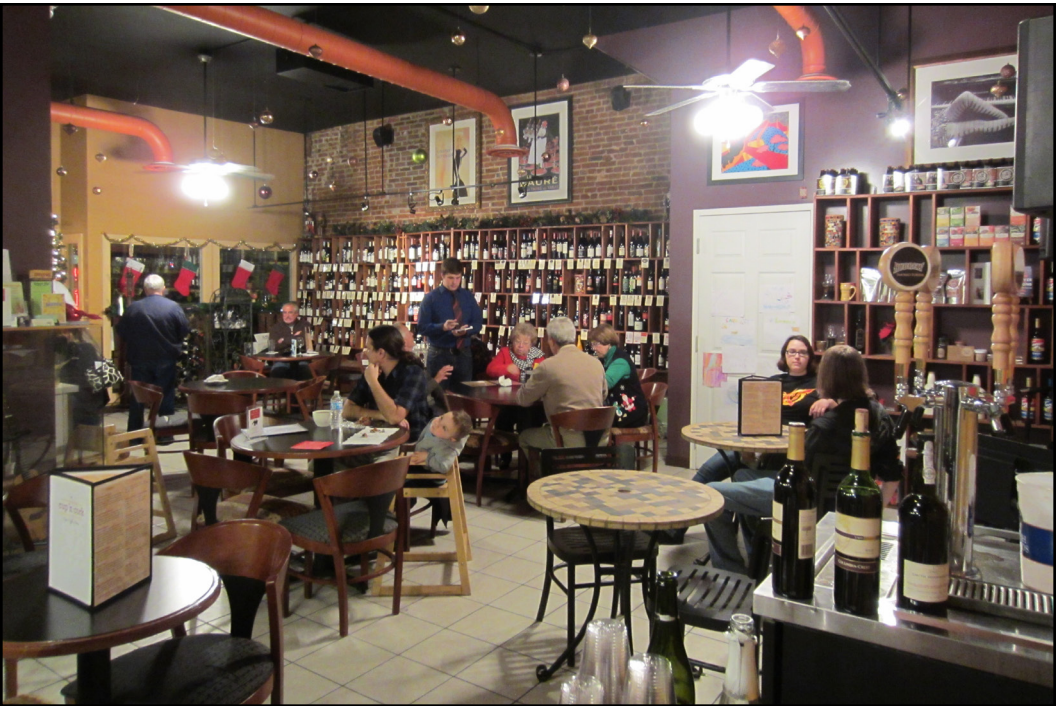
TOP: Participants enjoying wine and coffee at Cup N Cork during the 2013 Christmas Open House.