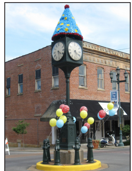
The Downtown Clock loved its birthday decorations!

TIP: Tell us what you have going on! We'll promote it in our weekly email updates & on our Facebook fan page.