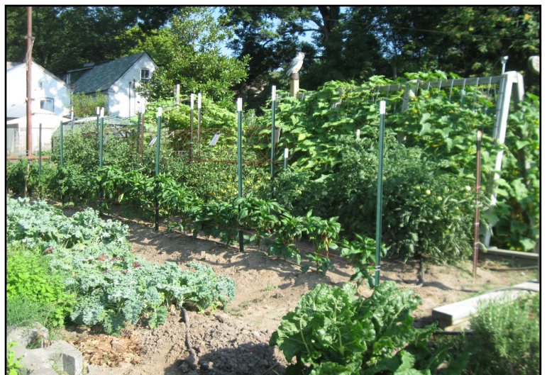
LEFT: Old Town Cape Scholarship Garden Sign RIGHT: A look inside the garden at the peppers and tomatoes.