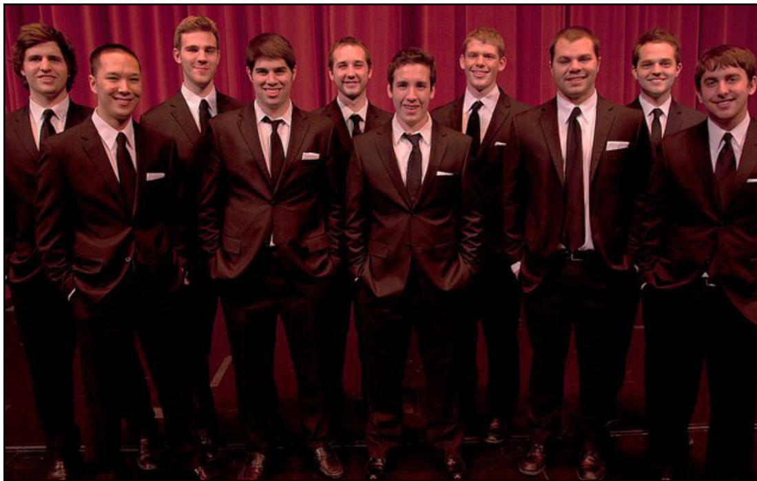
Indiana University's male a cappella sensation Straight No Chaser .