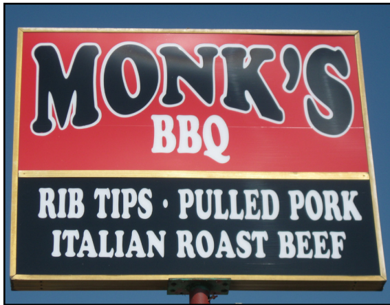
TOP LEFT: Monk's & Brook's Kitchen has a variety of BBQ items. TOP RIGHT: Framing options at River City Custom Framing.

Your businesses downtown keep thriving. Thank you for all you do! Help us support new businesses as they find their place downtown and together we can all strengthen our commercial district!